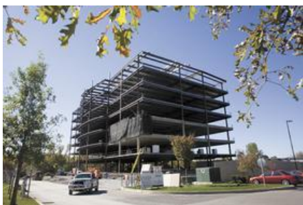
Boyle Investment Co. is already building a 175,000-square-foot office tower at 5000 Meridian in Cool Springs. It's going up as a speculative building, the first since the recession.